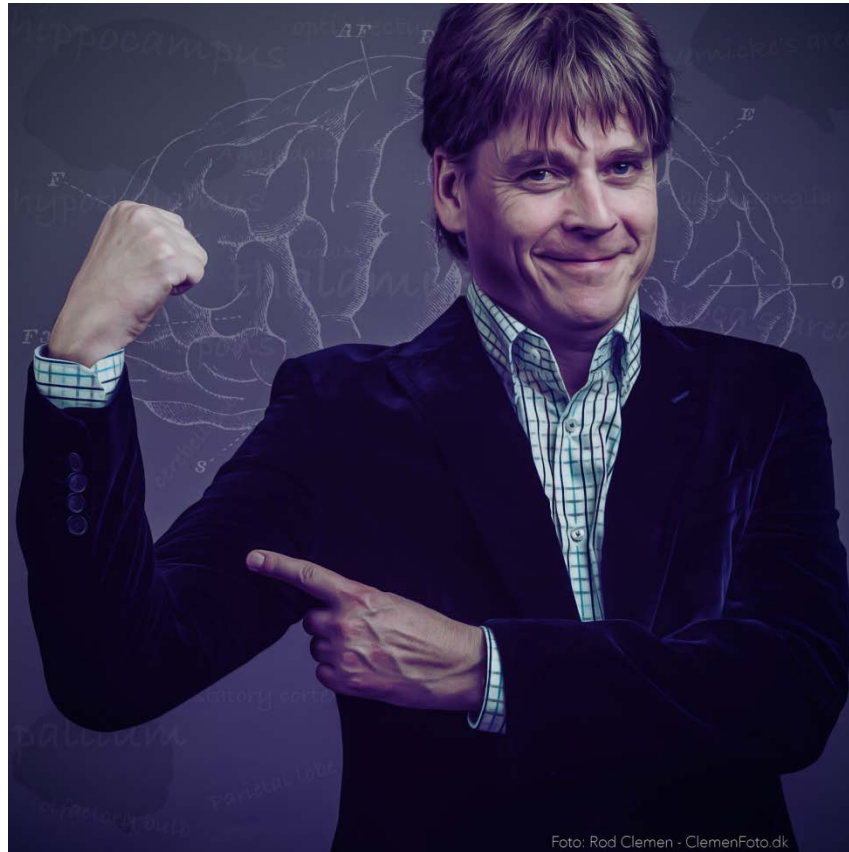
Peter Lund Madsen

This year's invited speaker on the theme "Scientific Communication – Science / Science Fiction" is MD PhD DrMed. Peter Lund Madsen